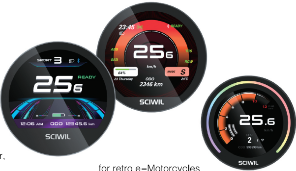
for retro e-Motorcycles